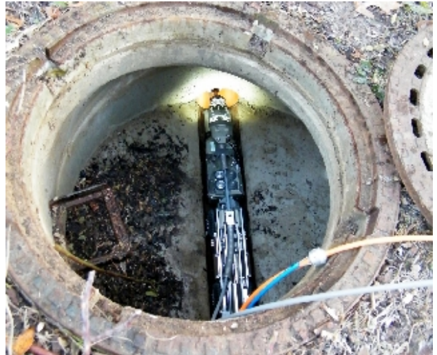
Sewer camera in use

This research project involves the development of a test programme to comparatively test and evaluate the inspection procedures and equipment currently available for site drainage systems. Practical experience is to be gathered in pilot deployments in cooperation between the Meyer-Entsorgung disposal company and the City of Osnabrück. In addition, general recommendations for action to provide both the public and system operators with assistance prior to the actual inspection are to be drafted, based on experience from the City of Osnabrück. The project is receiving funding from the German Federal Environmental Foundation (DBU).