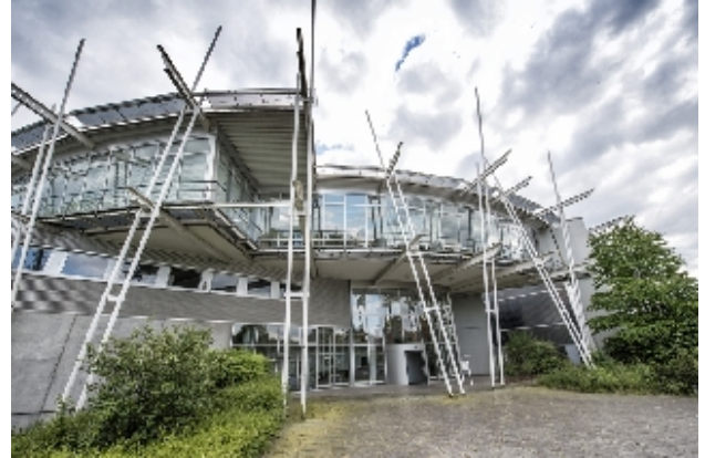
IKT, Gelsenkirchen, Germany

IKT - Institute for Underground Infrastructure is a neutral, independent non-profit institute, and works on solving practical and operational issues concerning underground sewers, pipes and other conduit engineering, its primary focus being on sewer systems. The institute conducts research projects, material testing, CIPP liner testing, consultations and seminars on the construction, operation and renovation of underground infrastructures.