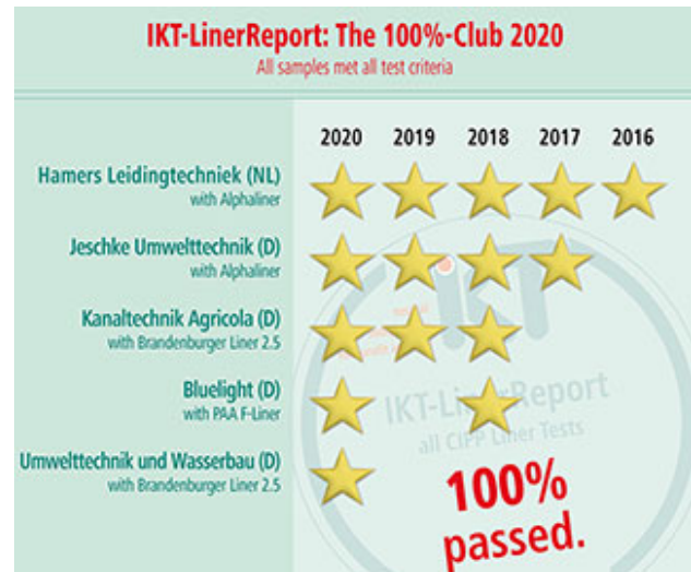
Table 3: The 100 % club of 2020 (click to enlarge)