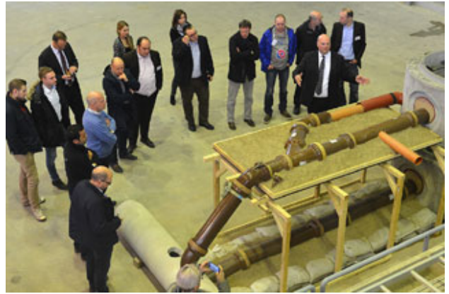
Project Steering Group considers 1:1 scale pipe layout to simulate house connections in the Large Scale Test Facility

The need for German sewer network owners to repair their own small diameter sewers and advise property owners on their private connections led to this examination of how effective patch repairs are in sealing damaged pipes against groundwater. Changes in pipe material, diameter, damage scenarios and bends were included in test rigs buried in the Large Test Facility and changing groundwater pressures were applied. Whilst effective repair is possible , special attention has to be paid to using the right product for some situations, like changes in pipe diameter.