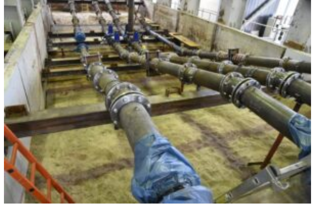
Experimental setup of pressure sewer pipes in the IKT large 1:1 scale test facility