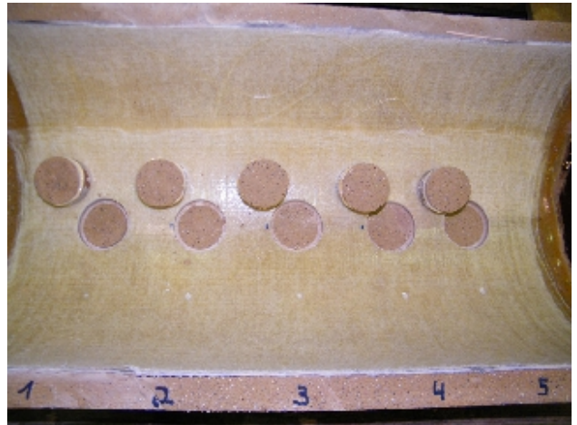
Tensile-adhesion testing of short-liners

Short lengths of selected repair systems were tested under external water pressure to examine their potential for sealing pipes against groundwater pressure. Comparative tensile-adhesion tests were undertaken using four short-liner systems on eleven different surfaces in order to determine the factors influencing performance and any need for surface preparation when refurbishing using short-liners.