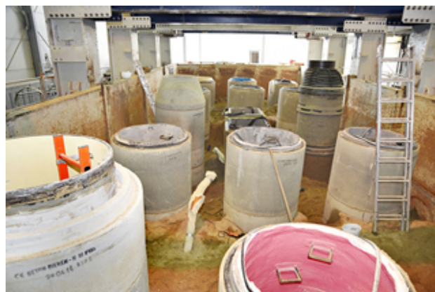
IKT's large-scale test rig for 1:1 scale tests