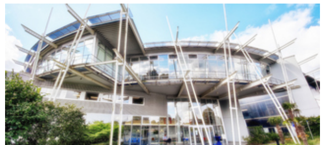
IKT – Institute for Underground Infrastructure