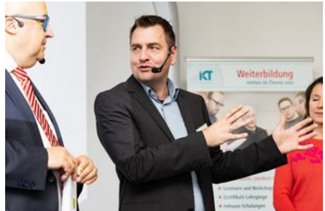
Knowledge works: Continuing education in IKT

Due to increased heavy rainfall and because rainwater is to be infiltrated and stored, the testing centre has already extended its accreditation to infiltration products. All DIBt approval tests required for this can now be carried out at the IKT.