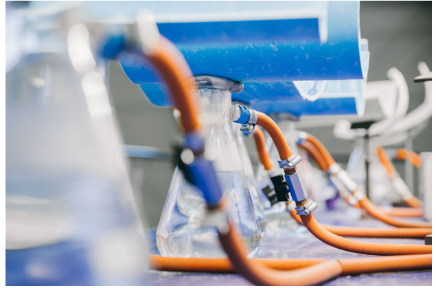
Water tightness test